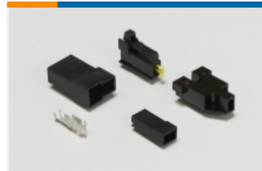
Magnet Wire Terminals(1)